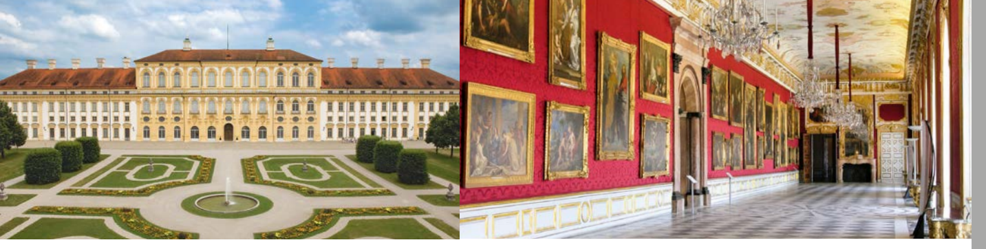
The Schleißheim New Palace with parterre in front