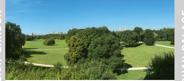
The English Garden